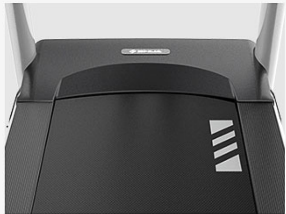
52cm Wide Running Width