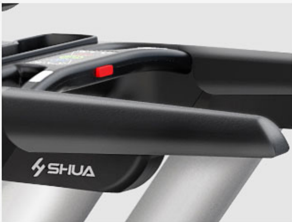
Large Side Support Handles