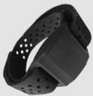
Optional Wrist Strap