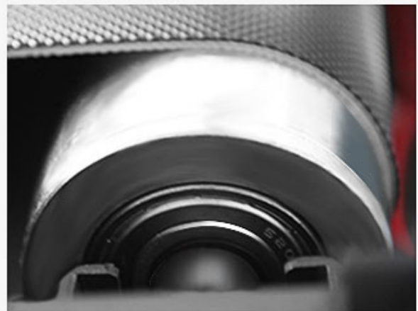
Large Crown Rollers