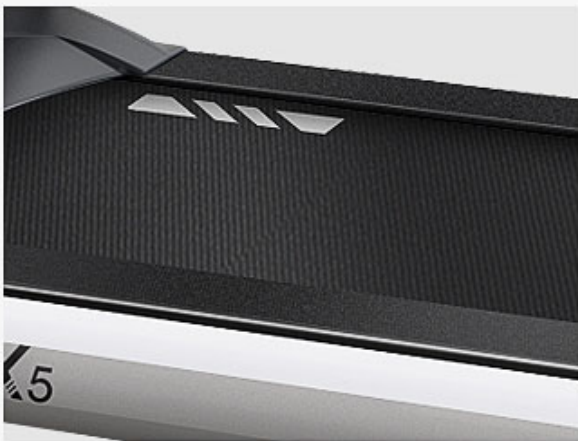
Anti Slip Surface