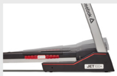
12 Power Incline Levels