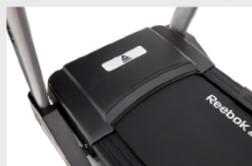
2 HP Motor - 16 KPH Max. Speed