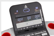
5 Window LED + Profile Chart