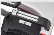
Quick Speed & Incline Keys