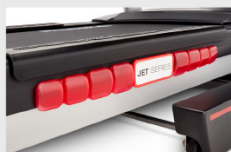
Air Motion Cushioning