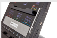
MP3 Input with 5W Speakers