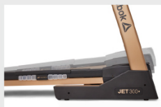
15 Power Incline Levels