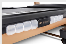
Air Motion Cushioning