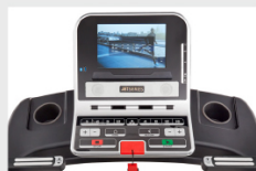
10.1" TFT Touchscreen