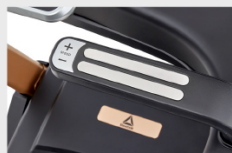
Quick Speed & Incline Keys