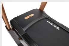
2.5 HP Motor - 20 KPH Max. Speed

With a dynamic console and Air Motion Tech, the Jet 300+ combines comfort with function. Providing all the tools for advanced home cardio, the 2.5 HP motor reaches 20 kph across 15 levels of power incline. Internet enabled, the InterAct 2.0 console is the latest evolution of our touchscreen display. Offering 10 customisable programmes and 27 pre-set workouts, the console delivers varied training options for all levels. Featuring apps such as Netflix and Spotify, the InterAct console provides entertainment to get you through your run. Compatible with the Reebok Fitness App