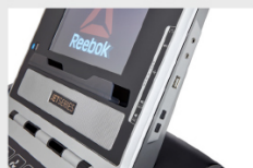
MP3 Input with 5W Speakers