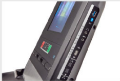
MP3 Input with 5W Speakers