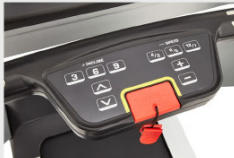
Quick Speed & Incline Keys