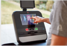
10.1" TFT Touchscreen