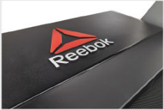
4 HP Motor - 20 KPH Max. Speed

Featuring a 10.1" touchscreen display, the InterAct Console provides in-depth feedback and programmes for total performance. The internet enabled system also features apps such as Netflix, Facebook and YouTube; with 5W speakers to play your music and videos aloud.