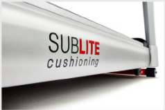
SubLite Cushioning Technology