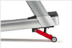
18 Power Incline Levels