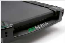
15 Power Incline Levels