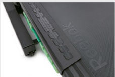
Air Motion Cushioning