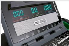
MP3 Input with 5W Speakers