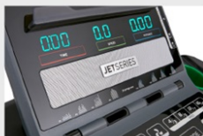
MP3 Input with 5W Speakers