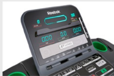
5 Window LED + Profile Chart