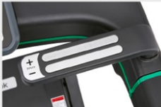
Quick Speed & Incline Keys