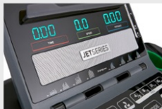
MP3 Input with 5W Speakers