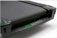
15 Power Incline Levels