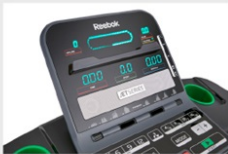
5 Window LED + Profile Chart