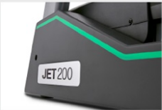
2.5 HP Motor - 18 KPH Max. Speed