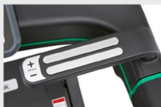
Quick Speed & Incline Keys