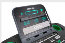
5 Window LED + Profile Chart