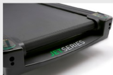
15 Power Incline Levels