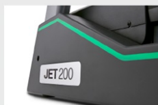
2.5 HP Motor - 18 KPH Max. Speed