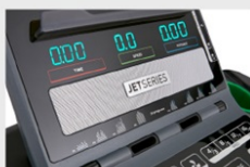
MP3 Input with 5W Speakers