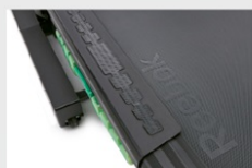
Air Motion Cushioning