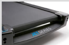
15 Power Incline Levels