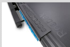
Air Motion Cushioning