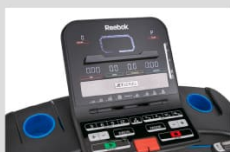
6 Window LED + Profile Chart