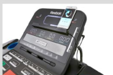
MP3 Input with 5W Speakers