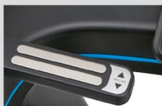
Quick Speed & Incline Keys