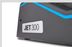
2.5 HP Motor - 20 KPH Max. Speed