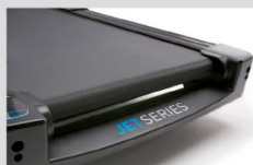
15 Power Incline Levels