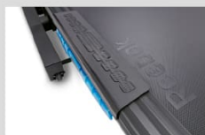
Air Motion Cushioning