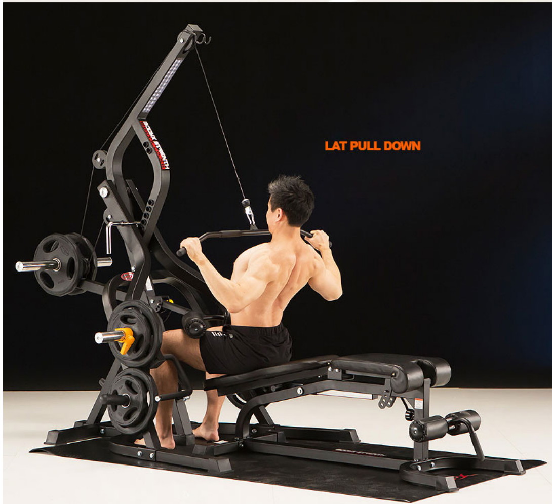
LAT PULL DOWN