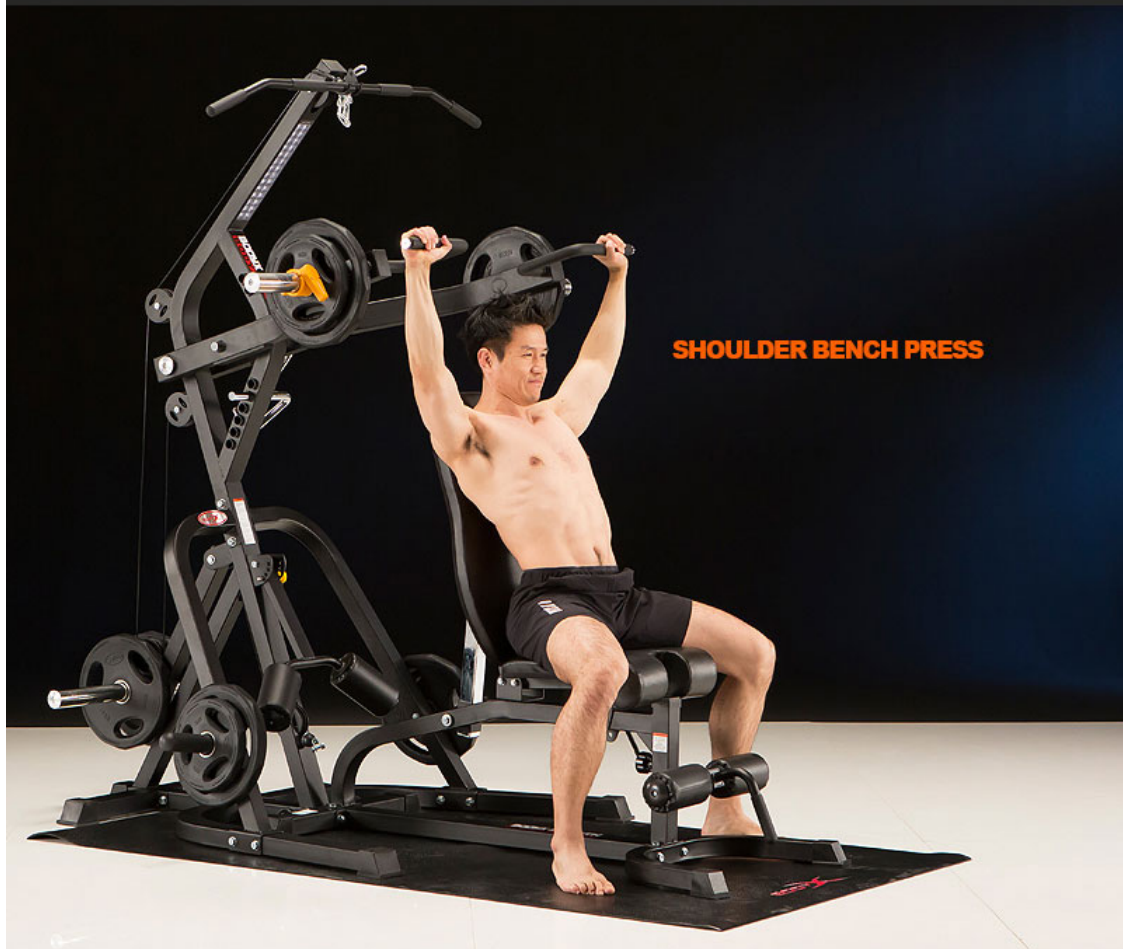
SHOULDER BENCH PRESS