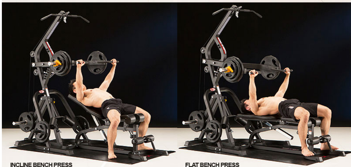
INCLINE BENCH PRESS