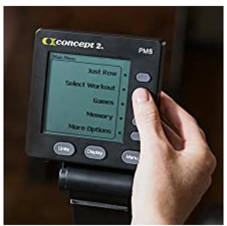
Trust Your Workout Data