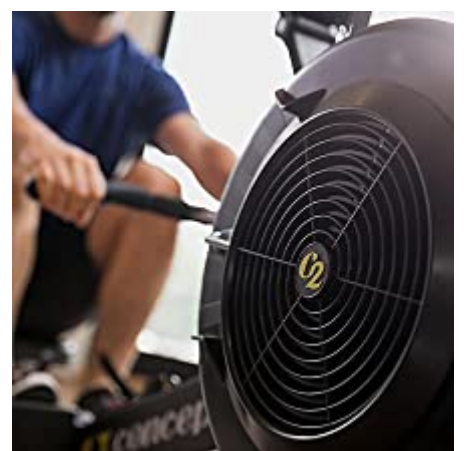
Control Your Workout Intensity