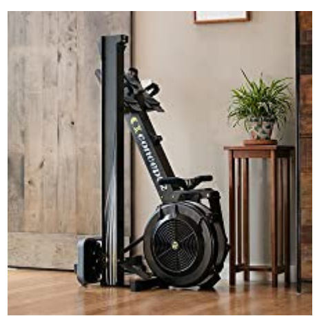
Easy to Assemble, Move and Store